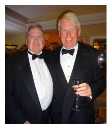
The President and the Club Captain

Happy New Year to everyone and good golfing.